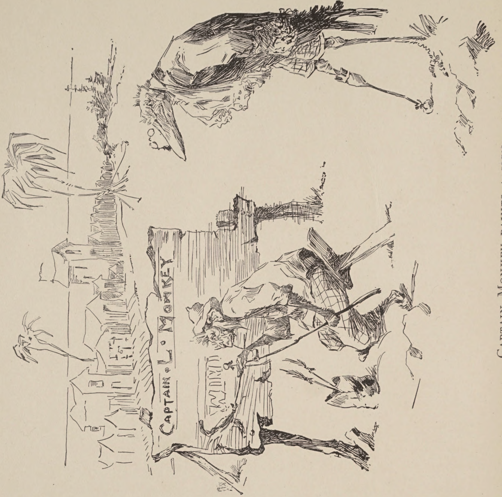
CAPTAIN MONKEY PAINTS A SIGN.